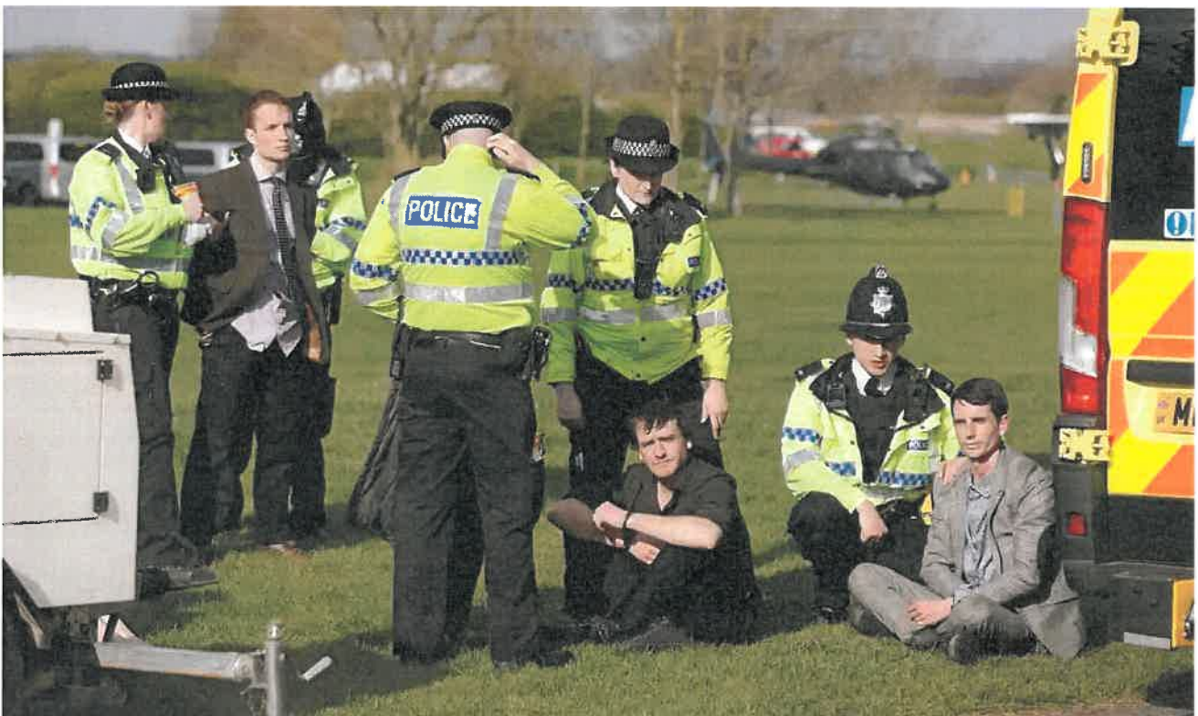
📷 Animal rights protesters arrested at the Grand National.